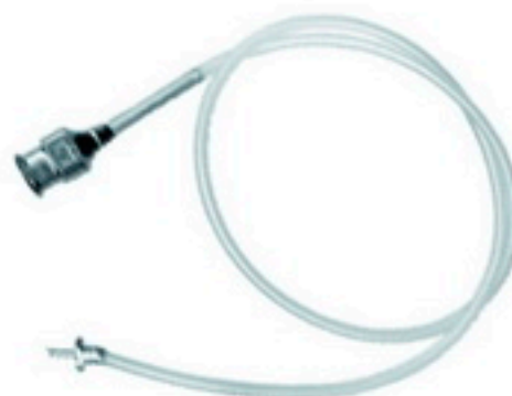
Vitreotomy Infusion Cannula Infusion Cannula 6 mm 4 mm B# 30-200 scale : 3/4