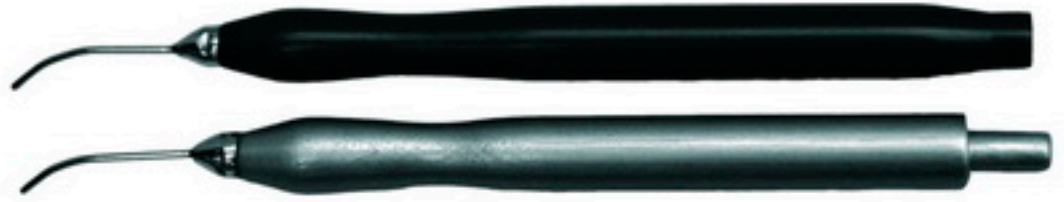
Bimanual Hand Pieces (Phaco) Integrated F# 10-151 scale : 1