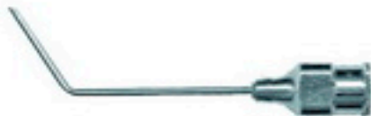
Fluid Irrigating Cannula G.20 F# 10-200