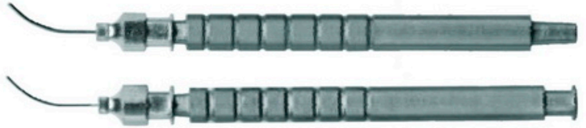
Bimanual Hand Pieces Hand Piece (phaco) F# 10-150 scale : 1