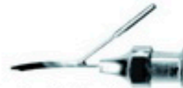
Double I / A Cannula (original) G.22 B# 20-110 G.23 B# 20-130