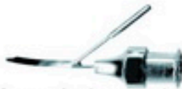
Double I / A Cannula (reverse) G.22 C# 20-115 G.23 C# 20-135