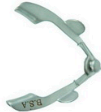
Sauer Speculum Open Plates B# 60-50 Plate Size 8mm