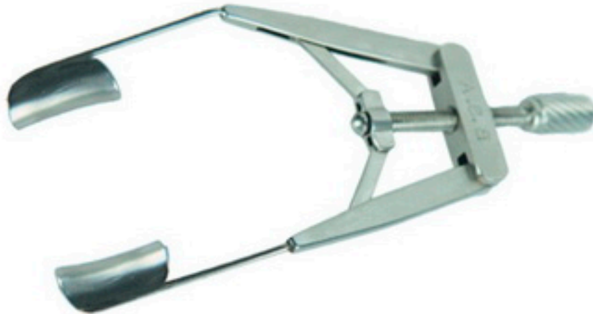
Lieberman Speculum Solid Plates B# 60-320 Plate Size 13.5mm