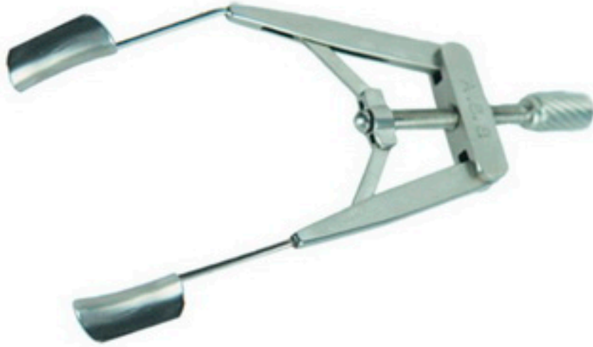
Reversible Speculum Solid Plates B# 60-340 Plate Size 13.5mm