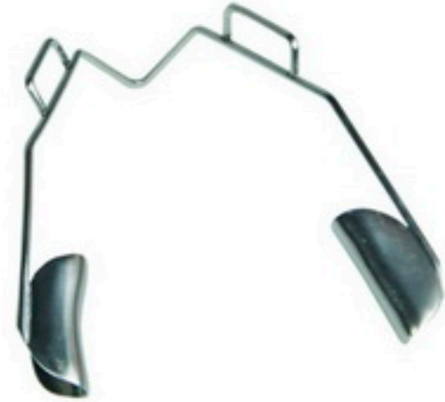
Eye Speculum Spring, Solid Plates B# 60-100-p Plate Size 13.5mm