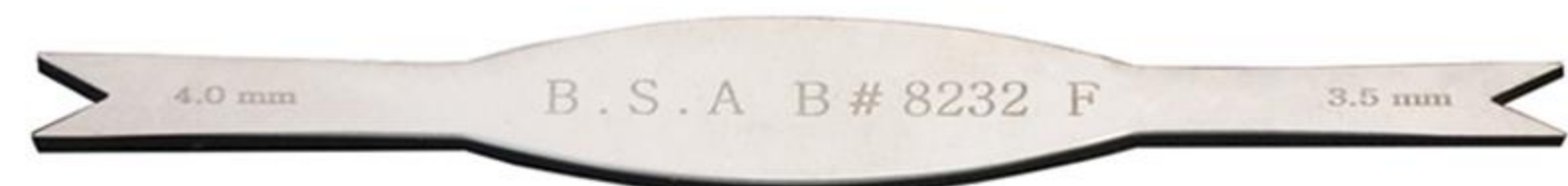
Marking Caliper B#8232F 4 mm, 3.5 mm