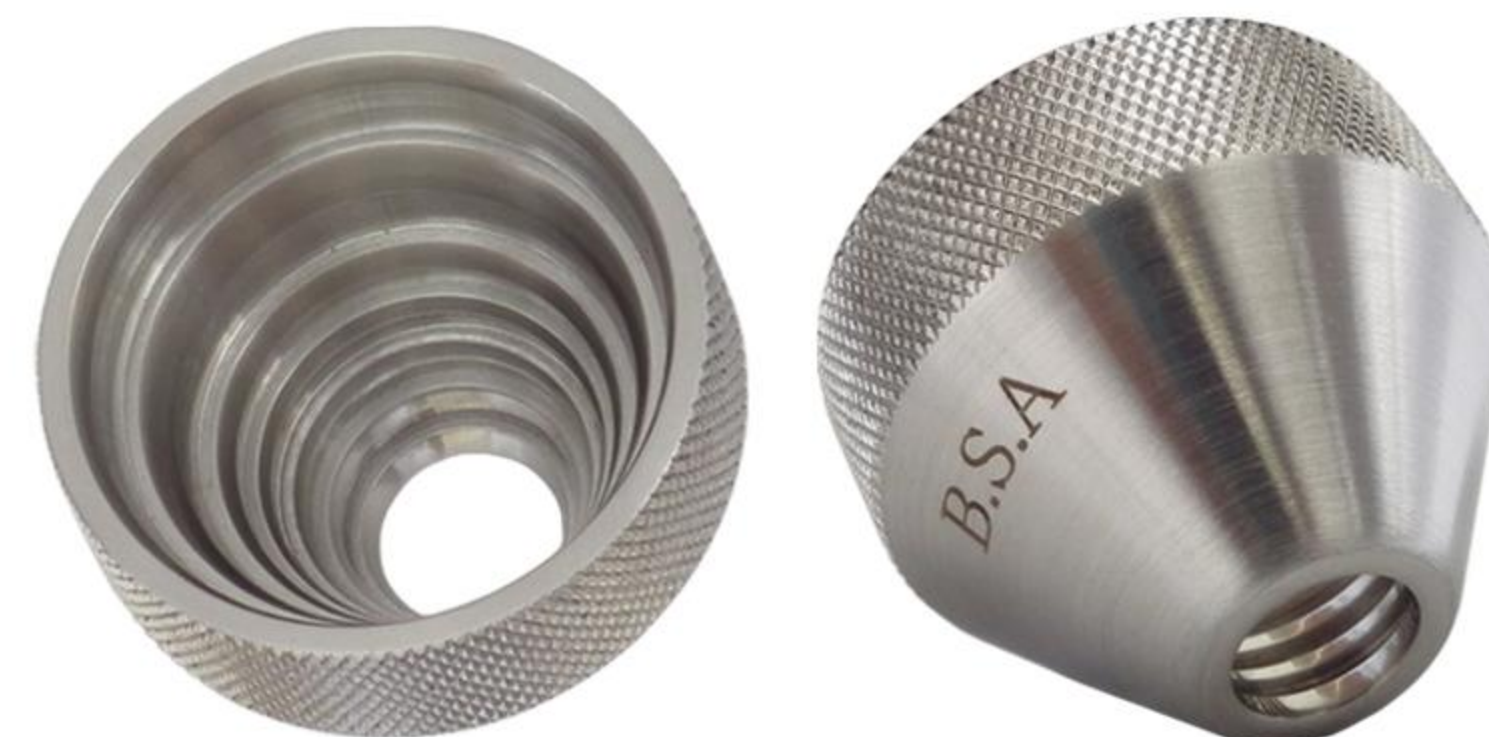
Keratoscope- Stainless Steel C#35-250