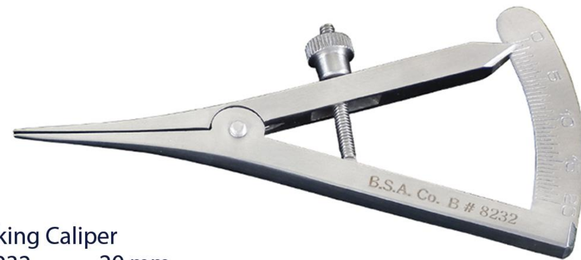
Marking Caliper B#8232 20 mm