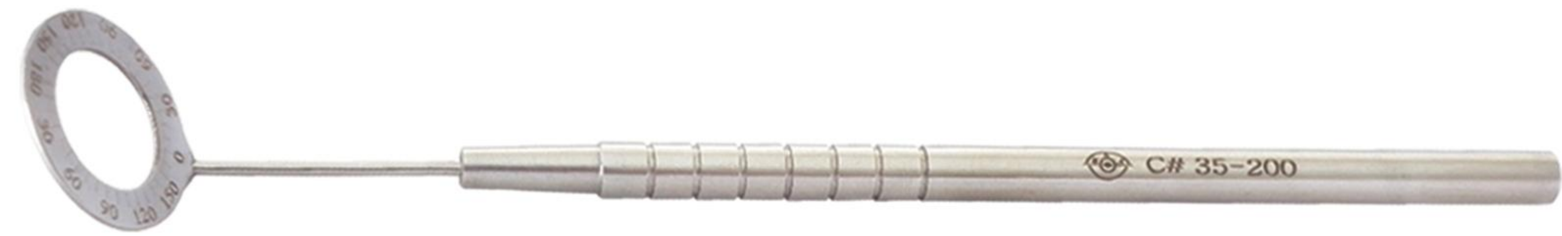
Mendez Degree Gauge C#35-200